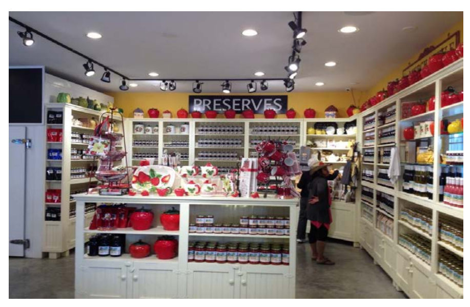
Figure 4 : Retail store at Krause Berry Farms

country crafts, and many other elements of country kitsch. Of the operations, Krause is much less a farm store and more of a destination, though people do come to purchase berries or take part in the u-pick. Their berry pies and corn pizza are well known in the region, and can be purchased and taken home.