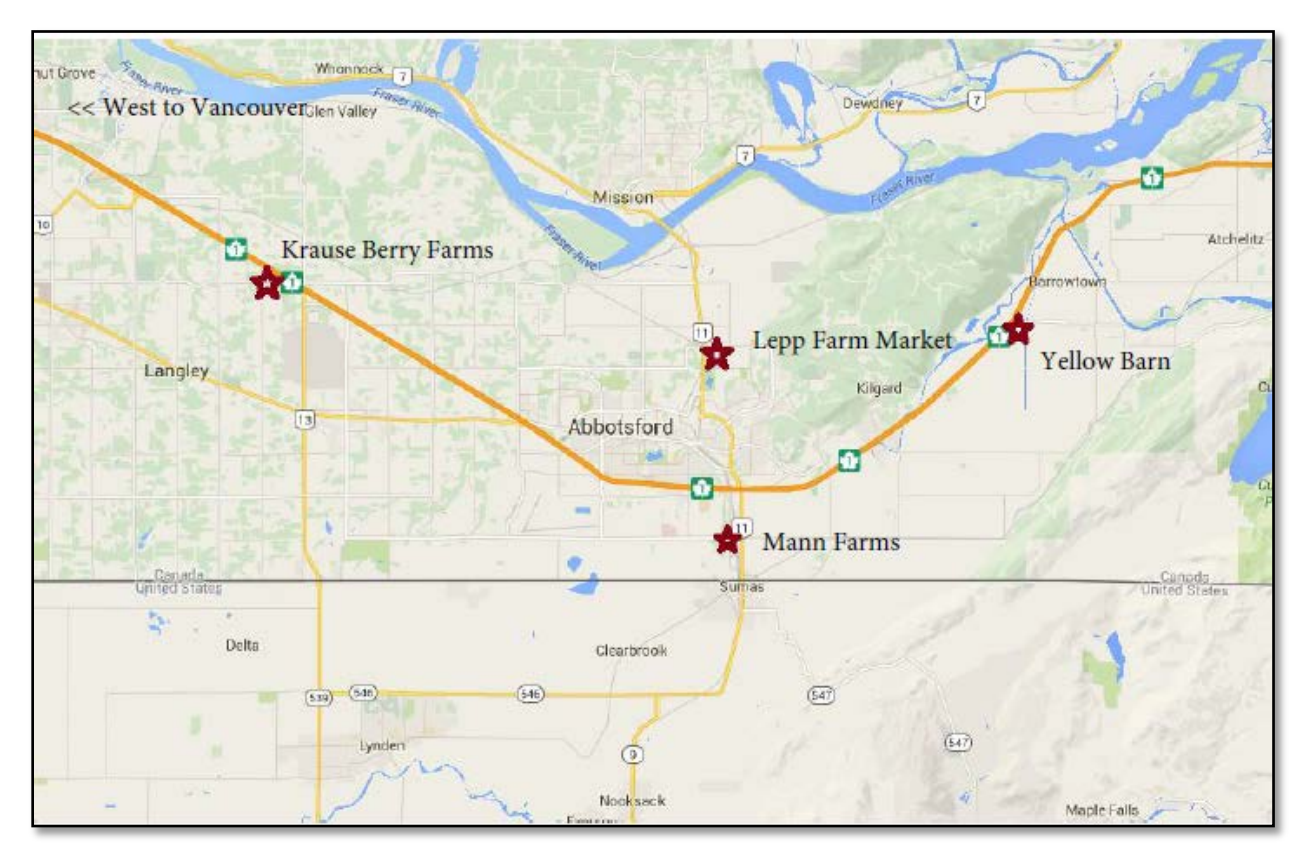
Figure 2 : Four farm store sites near Abbotsford selected for study (Map by Lisa Powell, created using Google Maps)