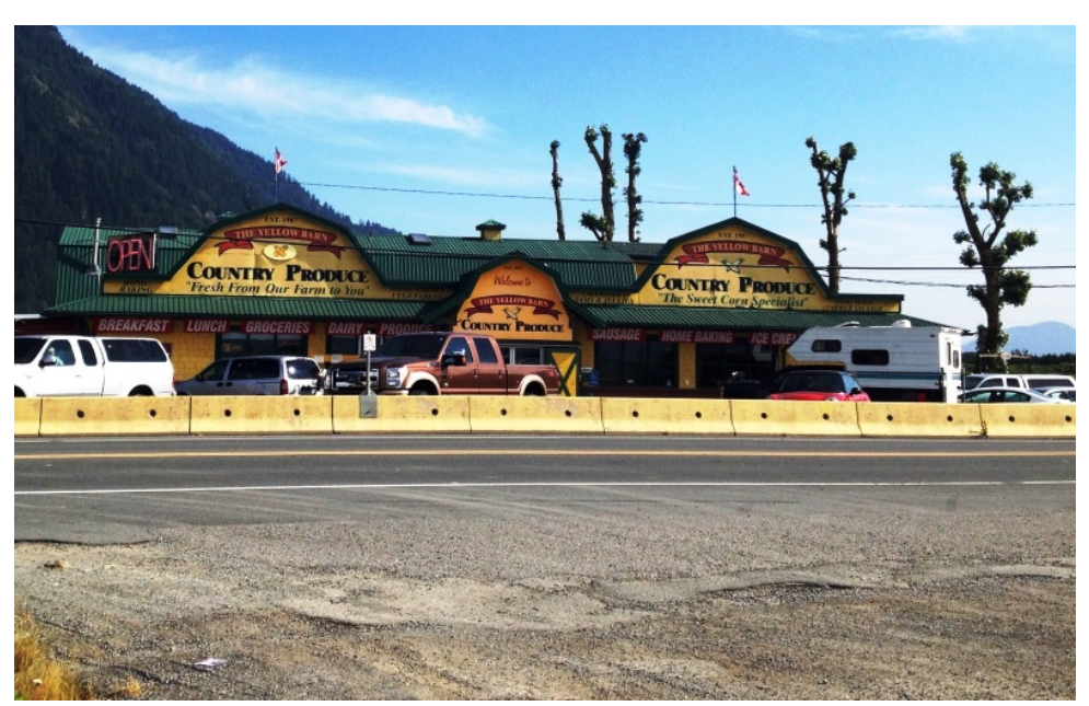
Figure 3: The Yellow Barn

months they also sell produce from BC's Okanagan region. In addition to produce sales, the Yellow Barn also sells preserves, canned goods, and baked goods produced on site, as well as some general grocery and snack food items. They have a deli counter that focuses on locally-sourced meats and cheeses, and a small restaurant. They also sell some antiques and other used items in their entry foyer, as well as some convenience household and toiletry items that may be of use to nearby residents and those traveling to the outdoor recreation areas.