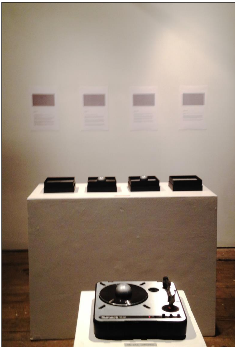
Figure 3: Artifacts from the sound recordings of Evigaturen

For food scholars, this exhibition asks how aesthetic representation can affect our understanding of food control and biopolitics; what happens when multimedia art produces a kind of activist artefact?