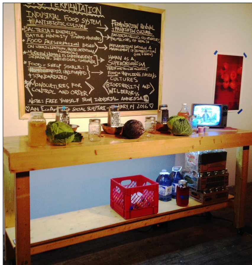
Figure 1: The OS Fermentation installation and manifesto

The installation also includes a chalkboard with a foodie manifesto and an old television set with one of the artists on the screen, demonstrating how to prepare fermented foods. Next to the installation, the artists include a projected stream of Internet videos that show people reacting to different fermented foods. The gallery audience is invited to sample the kombucha, blending the new media aesthetic and a sensory engagement with taste.