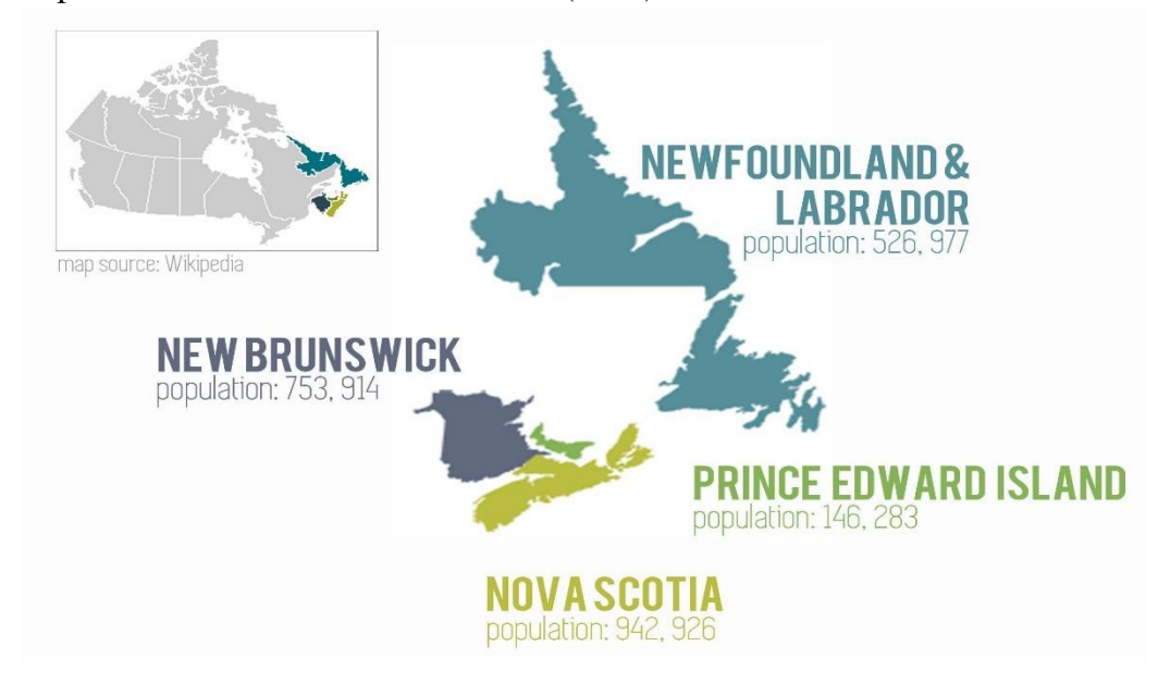
Figure 1: The geographic context and populations of each province in Atlantic Canada. Population estimates from census data (2014)

This paper synthesizes three related qualitative case studies that were conducted in Atlantic Canada in 2015 and 2016 and each resulted in a published report (Glasgow, Hughes & Knezevic, 2016; Jamieson, Hughes & Knezevic, 2016; Worden-Rogers, 2015). These studies explored aspects of seed saving such as project models, relationships between stakeholders, successes and challenges, and gaps in existing activities. Each case study was developed by drawing on literature reviews (of grey and scholarly publications), environmental scans, and interviews.