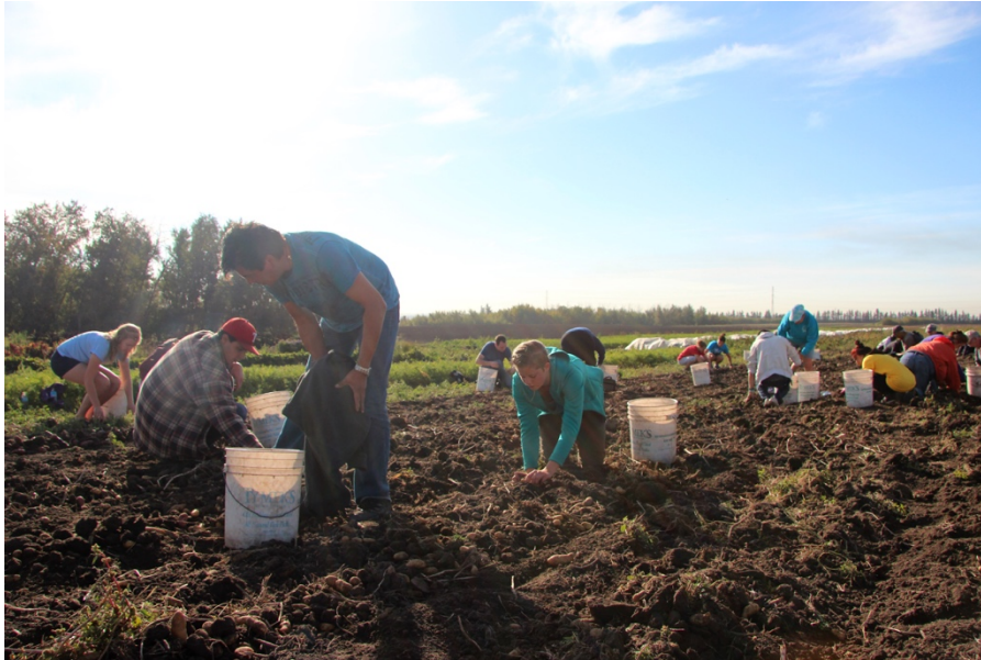
Figure 3: Participants Gardening at Lady Flower Gardens

Also similar to other community gardens, a significant portion of the produce harvested at LFG is donated to a social service agency (Furness & Gallaher, 2018). What distinguishes LFG from many other donation-model community gardens is that the gardeners harvest produce for others (Food Bank recipients) before harvesting for themselves, which creates a space for those that receive food donations to provide for others in need. Typically, those most likely to volunteer for food security initiatives are members of privileged classes (Beischer & Corbett, 2016). By contributing to the food security of others, LFG community members gain a sense of pride and develop active citizenship, which also influences their involvement in other community activities. LFG emphasizes collaboration and solidarity among all those involved in the garden, as work is done together, side-by-side. Some interviewees commented that treating everyone as “equals” helps build trust and respect. Such collaborative community involvement and capacity building helps to forge new exchanges between diverse community members, which is crucial in promoting a food justice approach (Cadieux & Slocum, 2015).